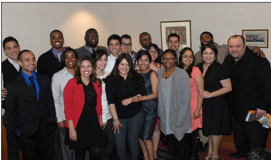
Graduating and Inducted McNair Scholars at the 11th NEIU McNair Annual Dinners