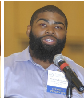
Universal Prayther, Health and